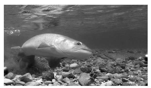
Figure 3. A huchen ( H. hucho ) female digging her nest in the Ybbs River.

a courtship behaviour consisting of low amplitude, high frequency body vibrations from head to tail, while the female was the fish that regularly performed nest digging by turning on her side and excavating a depression in the gravel by beating her tail (Fig. 3). It is important to note that in all the pairs recorded, quiverings and digs were always performed by a single fish, and no fish performed both quivering and digging.