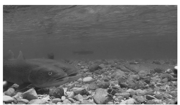
Figure 4. A huchen ( H. hucho ) pair spawning in the Ybbs River.

From previous descriptions with Siberian taimen the following behaviours were identified (Esteve et al. 2009b): probing: the female lie on the nest with her tail raised and presses her anal fin into the gravel; displacement quivering: the male quivers his body away from the female, which differs from normal quivering in its greater amplitude and shorter frequency; false spawning: the female assumes the spawning position, with her mouth gaping and trembling, but she does not release eggs; the spawning