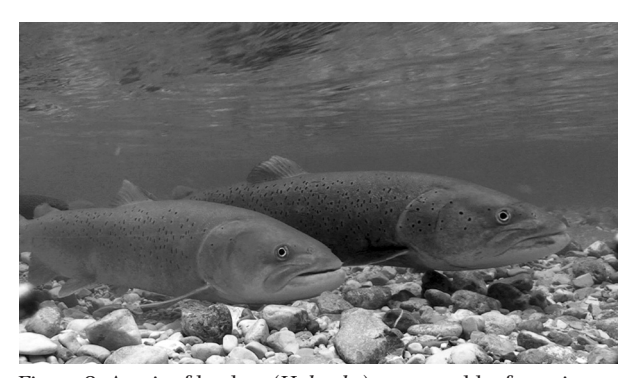
Figure 2. A pair of huchen ( H. hucho ) over a redd a few minutes before spawning. Female is on the left, and male on the right.

A Sony HDR-HC7 color digital video camera mounted inside an underwater housing was used to record the fish. The video signal from the camera was transmitted via cable to a digital recorder located on land. The camera was positioned approximately 0.75 m from the nest in which a female had been observed previously. Redds, which are disturbed areas of gravel containing nests, were located in tail pool areas with decreased water depths ranging from 1 to 0.5 m and increased flow velocity. Males and females presented with very little sexual dimorphism (Fig. 2), and in each of the rivers where recordings were made the male was slightly darker and redder in comparison to the female. Sex was confirmed by the behaviours exhibited. The fish were positioned one slightly behind the other; the male was identified as the fish intermittently performing quiverings, which is