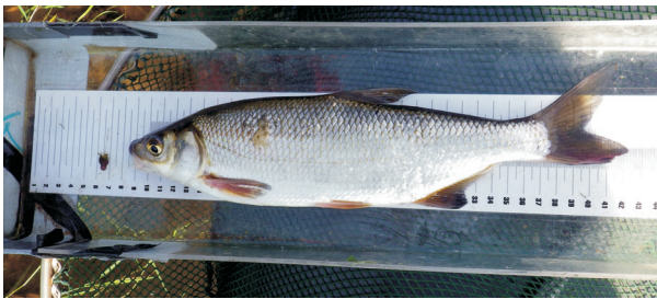
Figure 2. A vimba bream ( V. vimba ) specimen caught in the Nida River at Motkowice.

should be undertaken if required. Catching two YOY vimba bream specimens identified from thousands of juvenile fishes caught in the period of 2010–2015 indicates there is a need for very carefully sorting and analyzing small-sized material collected during field surveys. In the instances reported, vimba bream occurred syntopically with very abundant juvenile dace, Leuciscus leuciscus (L.), and more rarely with nase. Identifying adult vimba bream specimens is not difficult (anglers surprisingly often reported them as nase) because of several conspicuous characteristics: the protruding snout that has usual, dark pigmentation at the tip; the inferior position of the mouth; the scaleless keel between the pelvic fin insertion and the anal fin origin; the long anal fin (with 16–22 branched rays); and the scaleless dorsal midline between the occiput and the dorsal fin origin (Fig. 2). The same combination of traits distinguishes juvenile vimba bream from any other syntopic species, but their smaller body size makes identification more difficult. During the breeding season, adults can be recognized easily by the very dark to black coloration of most of the body with a yellow to orange abdomen and paired fins. This coloration can be observed in both sexes; however, in males it is usually far darker and intense (Bontemps 1971, Rolik and Rembiszewski 1987).