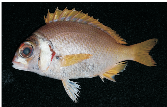
Figure 1. Scolopsis vosmeri , 173 mm TL, collected from Iraqi marine waters.